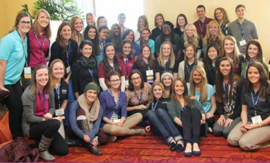
More than 60 WUOT students attended the 2014 AOTA/NBCOT National Student Conclave held in St. Louis, Mo., in November.