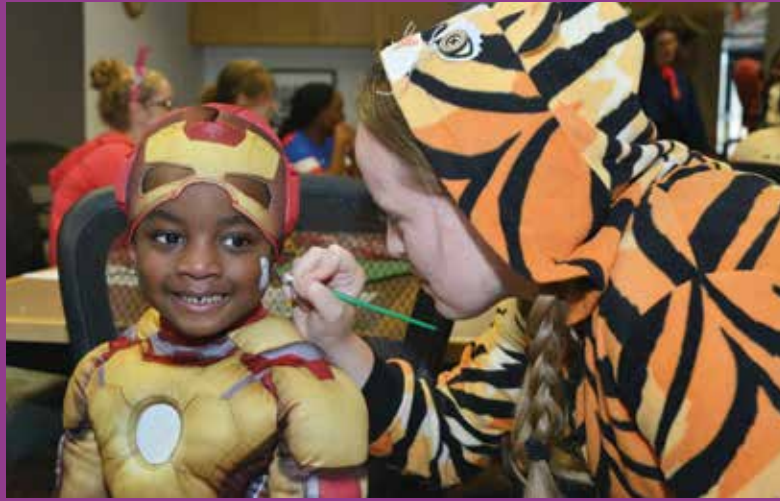
Students were on hand Oct. 25 to visit with area families at the "not-so-scary" Halloween event sponsored by WUOT.