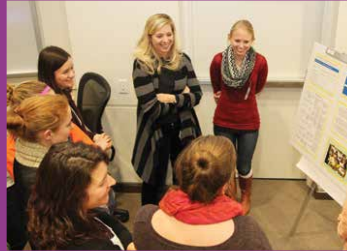
Second-year students present in the Sensorimotor Interventions Evidence-Review Poster Session on Dec. 2.