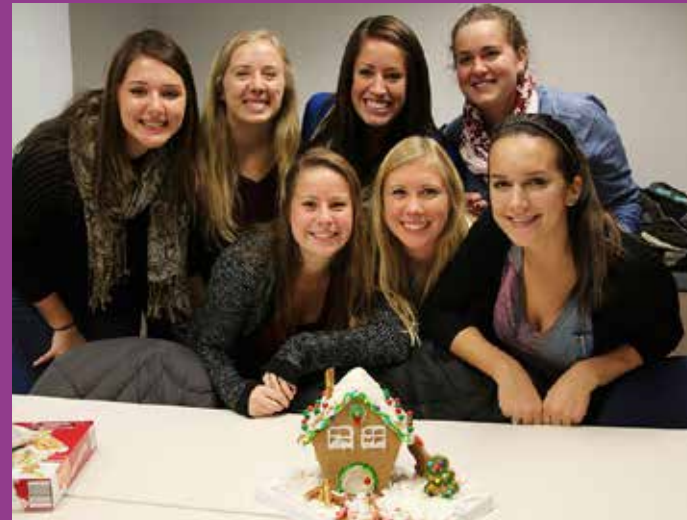
Students participated in the annual gingerbread contest on Dec. 3.