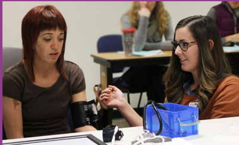
For the second-year Integrated Curriculum Experience (ICE), students worked with "standard patient" actors to recreate occupational therapy interviews, assessments, and interventions with a client on Dec. 10.